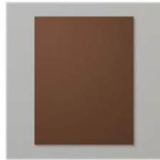
Early Espresso 8-1/2" X 11" Cardstock 119686 Price: $8.75