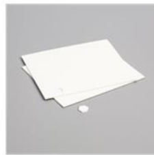
Stampin' Dimensionals 104430 Price: $4.00