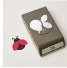
Ladybug Builder Punch 157698 Price: $18.00