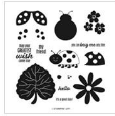
Hello Ladybug Photopolymer Stamp Set (English) 157693 Price: $18.00