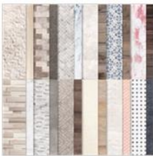
In Good Taste Designer Series Paper 152494 Sale: $12.60 Price: $21.00