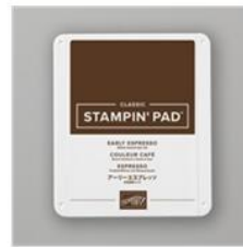
Early Espresso Classic Stampin' Pad 147114 Price: $7.50