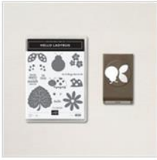
Hello Ladybug Bundle (English) 157699 Price: $32.25