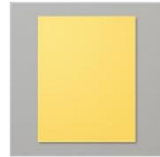
Daffodil Delight 8-1/2" X 11" Cardstock 119683 Price: $8.75