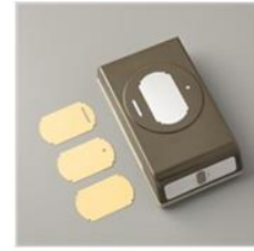
Label Me Fancy Punch 151297 Price: $18.00