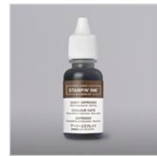
Early Espresso Classic Stampin' Ink Refill 119789 Price: $3.75