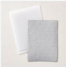
Hive 3D Embossing Folder 157955 Price: $9.00