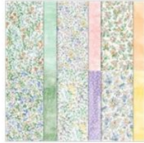
Hand-Penned 12" X 12" (30.5 X 30.5 Cm) Designer Series Paper