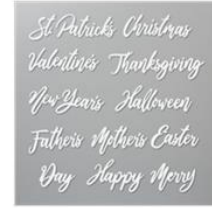
Word Wishes Dies (En)