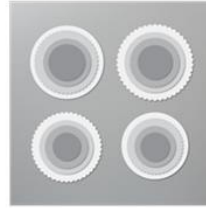
Layering Circles Dies