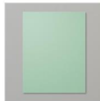
Mint Macaron 8-1/2" X 11" Cardstock