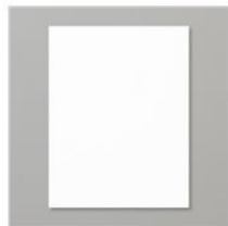
Basic White 8-1/2" X 11" Cardstock