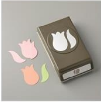
Tulip Builder Punch