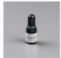
Tuxedo Black Memento Ink Refill 133456 Price: $5.00