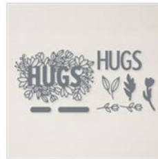
Layering Hugs Dies 155860 Price: $28.00