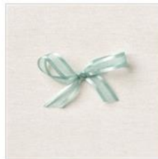
Soft Succulent 3/8" (1 Cm) Open Weave Ribbon 155780 Price: $7.00