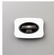
Tuxedo Black Memento Ink Pad 132708 Price: $6.00