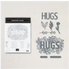
Sending Hugs Bundle 155859 Price: $44.00