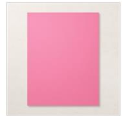
Polished Pink 8-1/2" X 11" Cardstock 155710 Price: $8.75