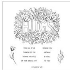
Sending Hugs Cling Stamp Set 155022 Price: $21.00